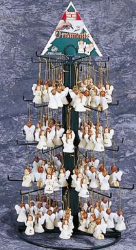
MAO32-144 (ANGELS) 13" x 13" x 23"