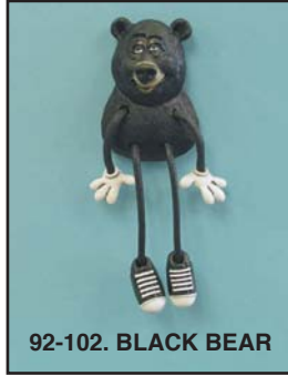
92-102. BLACK BEAR