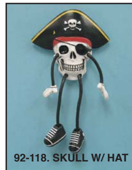
92-118. SKULL W/ HAT